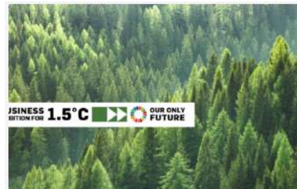
Business mobilisation to achieve the 1.5C climate target

Strong local engagement for sustainability