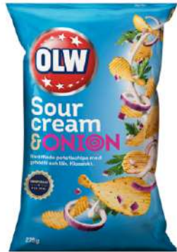
OLW Sourcream & Onion