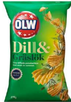
OLW Dill & Gräslök