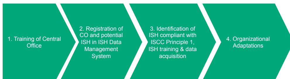
Figure 4: The actions of step “Management & Implementation”