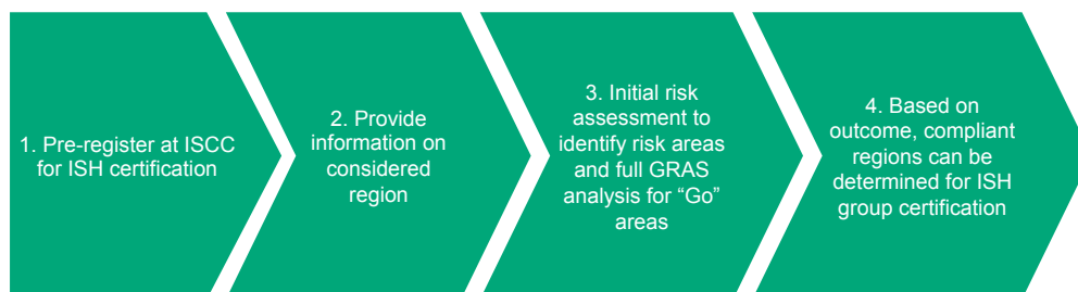
Figure 3: The actions of step “Preparation, Scoping & Risk assessment”

Preparation and Scoping includes certain actions for the company interested: