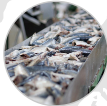
Fish fat from fish processing waste