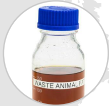
Animal fat from food industry waste