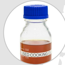
Used cooking oil