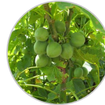
Jatropha oil in projects only