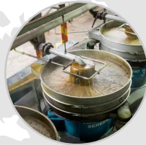
Vegetable oil processing waste and residues (e.g. PFAD, PES, SBEO)