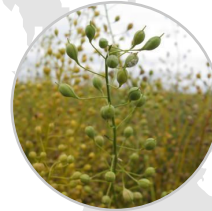
Camelina oil in projects only