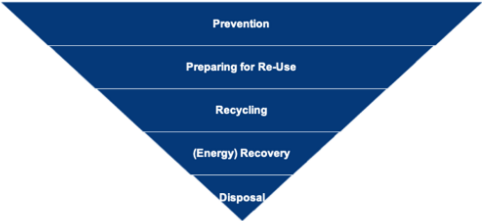
Figure 1: Waste hierarchy according to Article 4 of the WFD