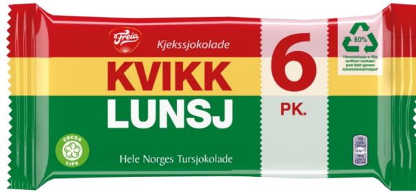
Freia Kvikklunser – Norway

80% Recycled Plastic in multipack packaging