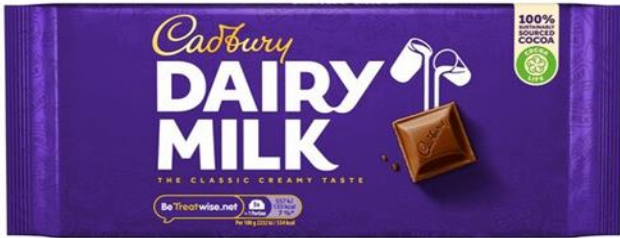
Cadbury Dairy Milk – UK

30% Recycled Plastic in 110g tablet packaging