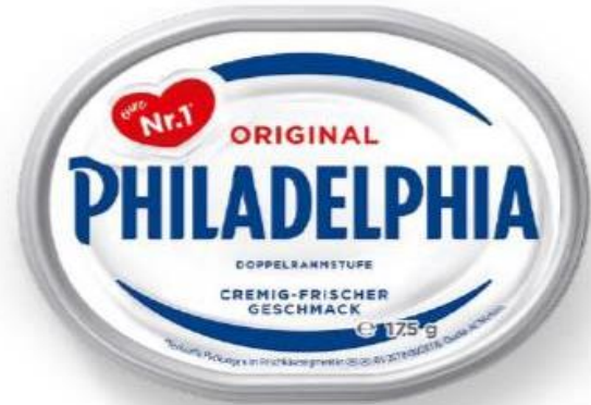
Philadelphia – EU