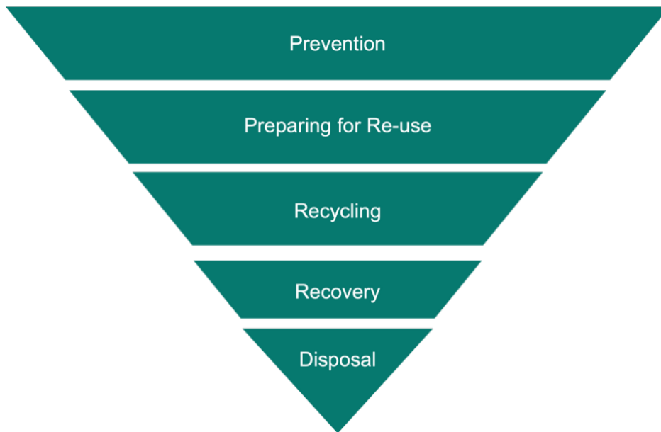
Figure 1: Waste hierarchy according to Article 4 of the WFD

The principles of the waste hierarchy as specified in Art. 4 of the WFD lay down a priority order of five options to deal with waste ( Figure 1 ).